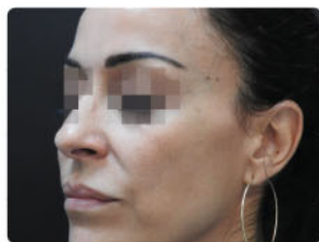
After 4 treatments