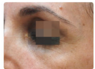
After 3 treatments